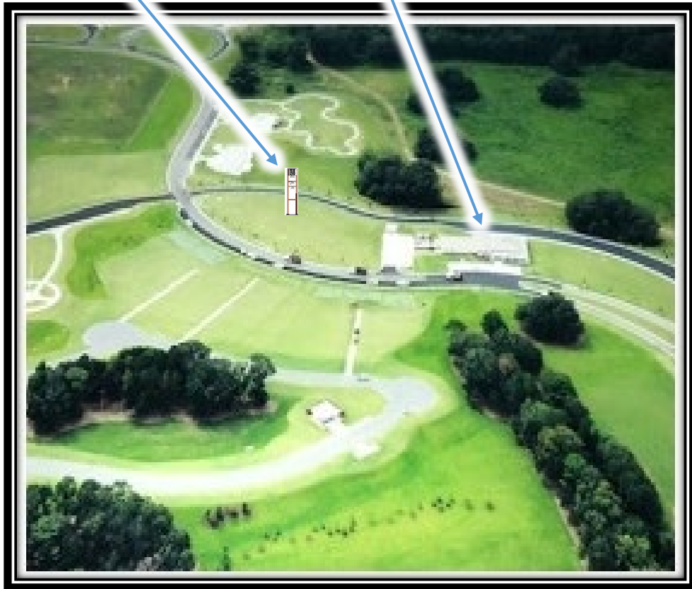
Tallahassee National Cemetery