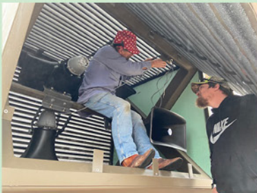
Campbellville workers installing the Speakers on the Tower.

From the inception of an intent of placing a Carillon Bell Tower at the Tallahassee National Cemetery, it took five years of hard work, fund raising, advertising, sorting out the responsibilities of the different parties involved and dealing with architects, and a host of departments involved. The culmination is at last visible.